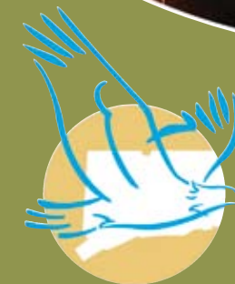
Chestnut-sided Warbler