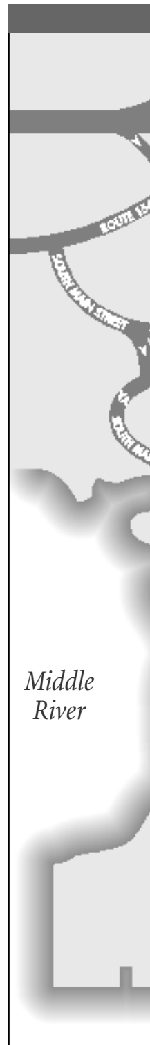
*Volunteer parking with shuttle