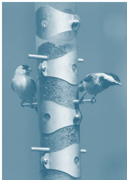
A Black-capped Chickadee and a Goldfinch visit one of the Center at Fairfield's bird feeders.

Calling all young scientists! Join us as we explore the world outside our back door. This fall we will search for insects, birds and mammals and discover where amphibians and reptiles go for the winter. What happens to the animals as the seasons change from fall to winter? We will search the Sanctuary for clues, create experiments and study the Center's education animals to discover the answers to the questions. Single program fee: $10 CAS Members, $14 Non-members. 6-program series fee: $54 CAS Members, $78 Non-members.